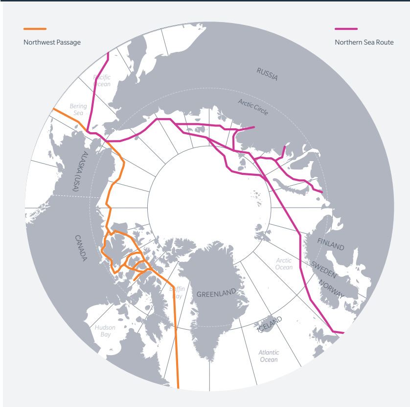
FIGURE 4 The Arctic Sea Routes

The lack of hydrographic data for the Arctic region should remain a major concern for any sensible operator.