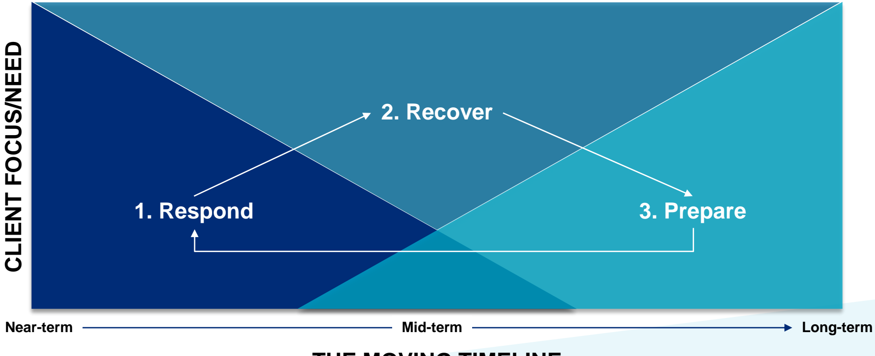
THE MOVING TIMELINE

The crisis is fluid and organizations may find themselves in each stage simultaneously