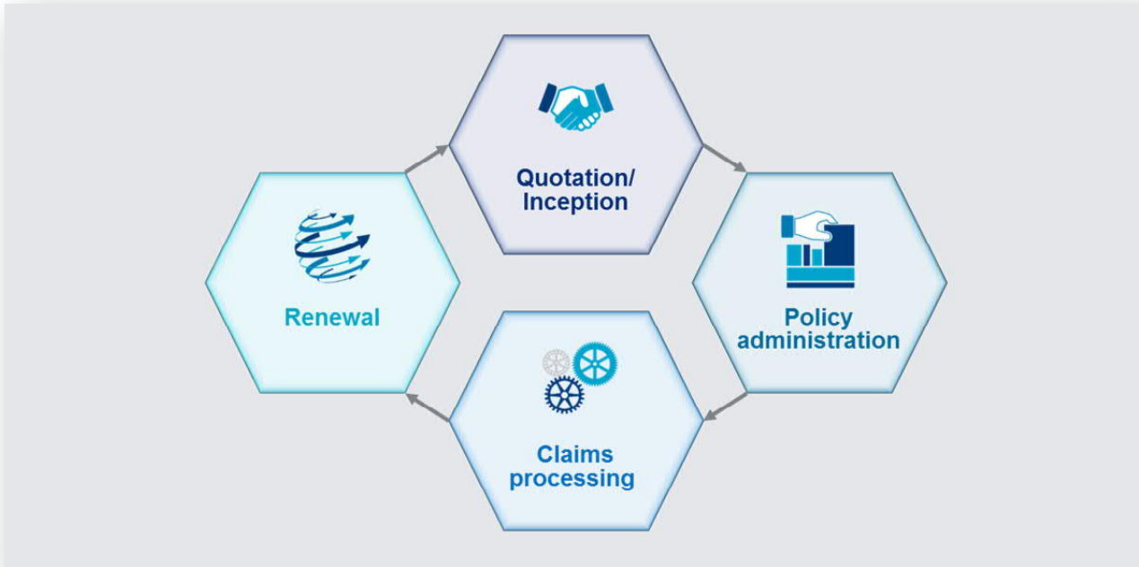
CHART 2: FLOWS OF PERSONAL DATA THROUGH THE INSURANCE LIFECYCLE