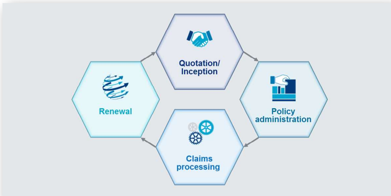
CHART 2: FLOWS OF PERSONAL DATA THROUGH THE INSURANCE LIFECYCLE