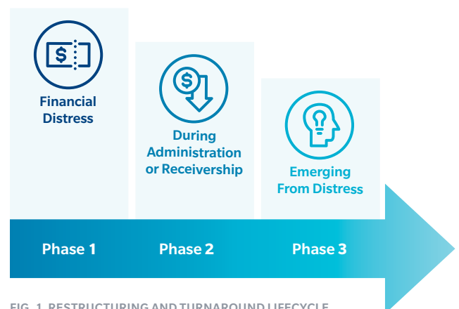
FIG. 1. RESTRUCTURING AND TURNAROUND LIFECYCLE

The economic downturn associated with the pandemic will likely place many companies in financial distress. Each stage of the restructuring and turnaround lifecycle presents unique risks and issues. Valuation can play a key role in every step, including when a company comes out the other side on the road to recovery.