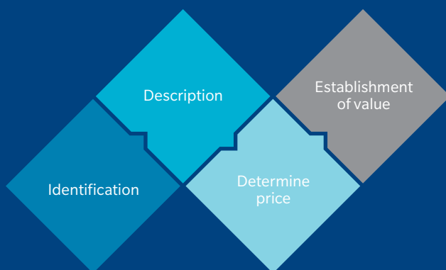
FIG. 2. TAX CONSOLIDATION VALUATIONS PROCESS

The Marsh valuation team remains up to date with the latest Australian Taxation Office (ATO) guidelines regarding valuations for Tax Consolidation. We follow the process of: