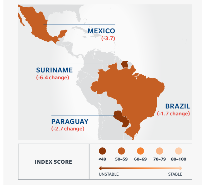
FIGURE 3 Key Short-term Political Risk Score Changes: Latin America Scores and observations from BMI Research

Several Latin American countries, including Brazil, Colombia, Mexico, Paraguay, and Venezuela, will hold presidential and legislative elections in 2018. The uncertainty caused BMI Research to increase its estimate of political risk in each of those countries, as portrayed in the short-term political risk index (STPRI), in which lower scores represent decreased stability. Venezuela has experienced continued unrest throughout 2017 as a result of an economic crisis, which has continued to weigh on its STPRI, now at 30.6. Suriname saw the steepest decline in STPRI score in the region, falling from 52.9 to 46.5, stemming from economic crisis and the ongoing murder trial of President Desi Bouterse.